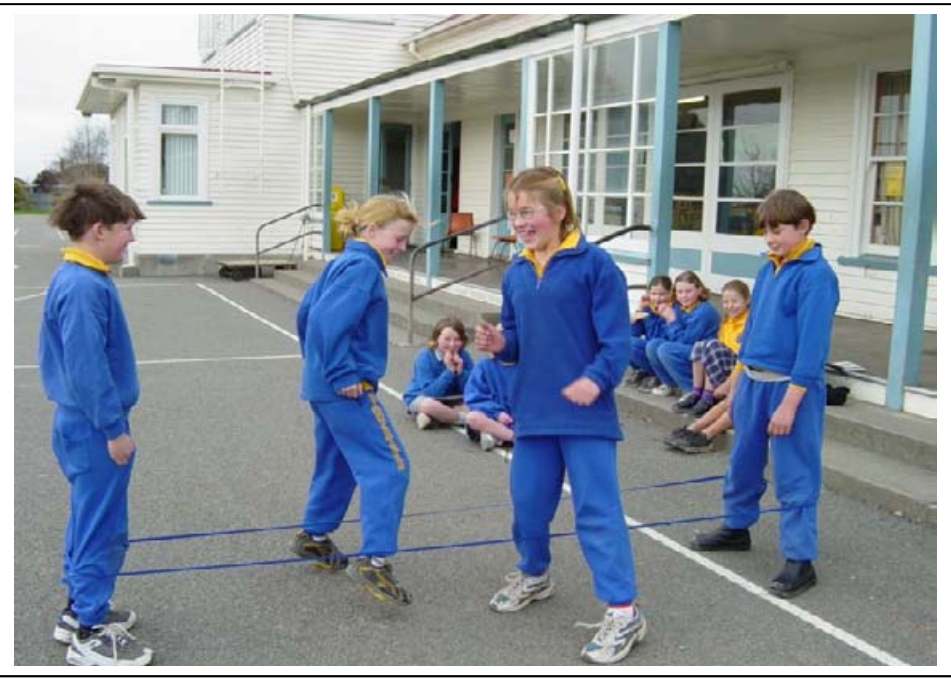
Hampstead Primary School – Ashburton, New Zealand

Primary school playgrounds are the focus of much of this activity, as 'playgrounds themselves may be the only school setting in which spontaneous peer interactions are condoned' (Borman, 1979, p 251). This literature review will examine available research on gender differences in the traditional play that takes place in school playgrounds. This will involve looking at the more general play activities of children, before focussing on the more specific verbal aspects of this play.